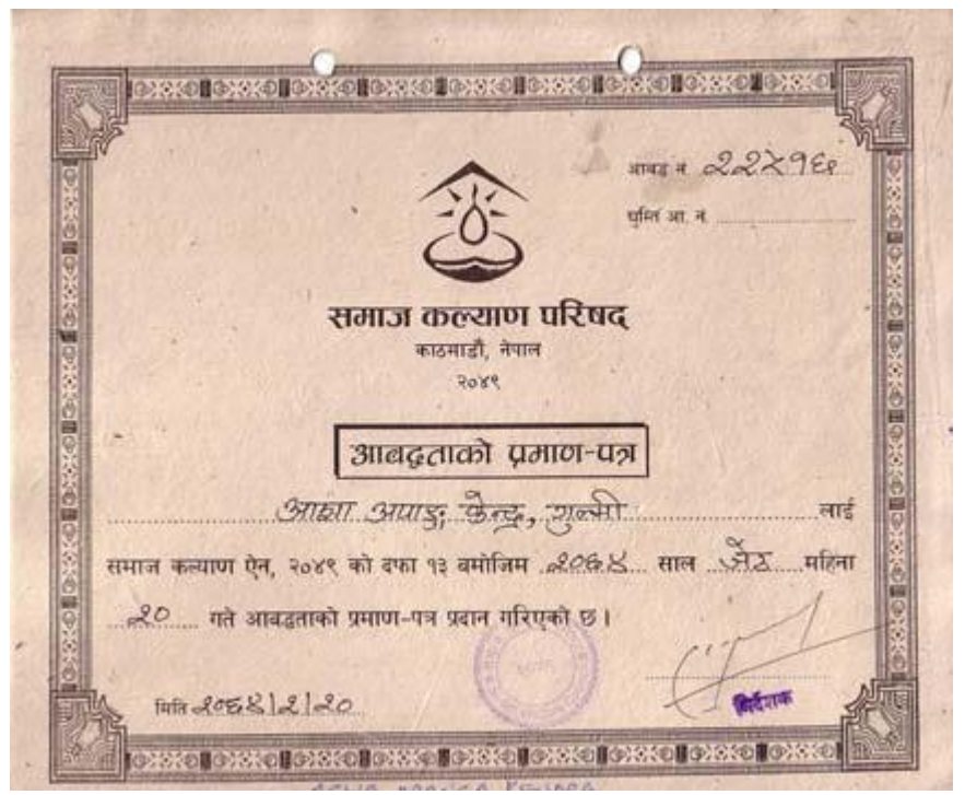
Copy of certificate of affiliation with the Social Welfare Council